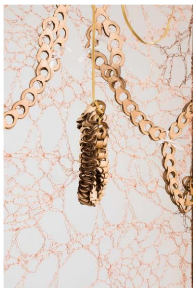
ektor garcia, portal I (detail), 2019. Copper, leather.

ektor garcia: matéria prima April 2 – September 4, 2022