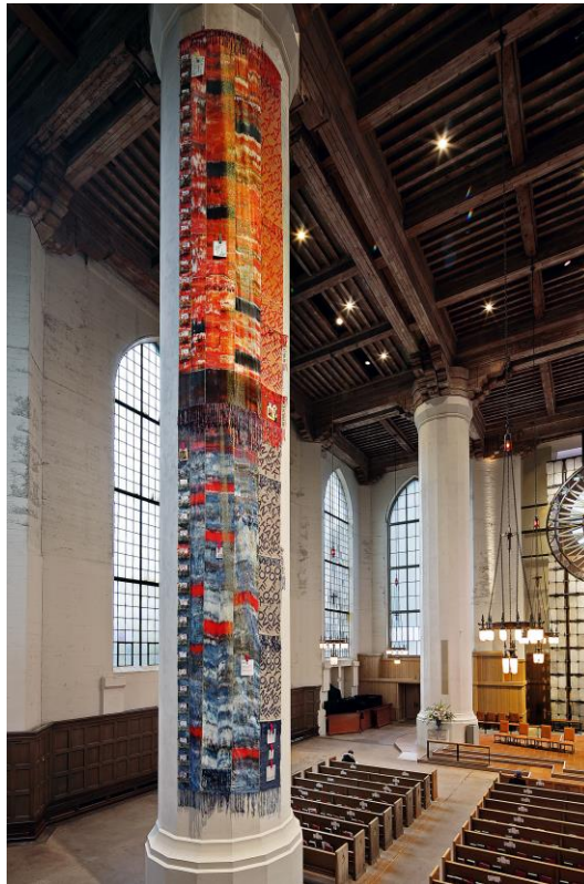
Josh Faught (U.S., b. 1979). Sanctuary , 2017. [Installation view: Saint Mark's Cathedral, Seattle, WA. 2017.]

This exhibition celebrates Faught's ability to intertwine personal and collective narratives, offering visitors an opportunity to reflect on themes of identity, community, and the power of craft.