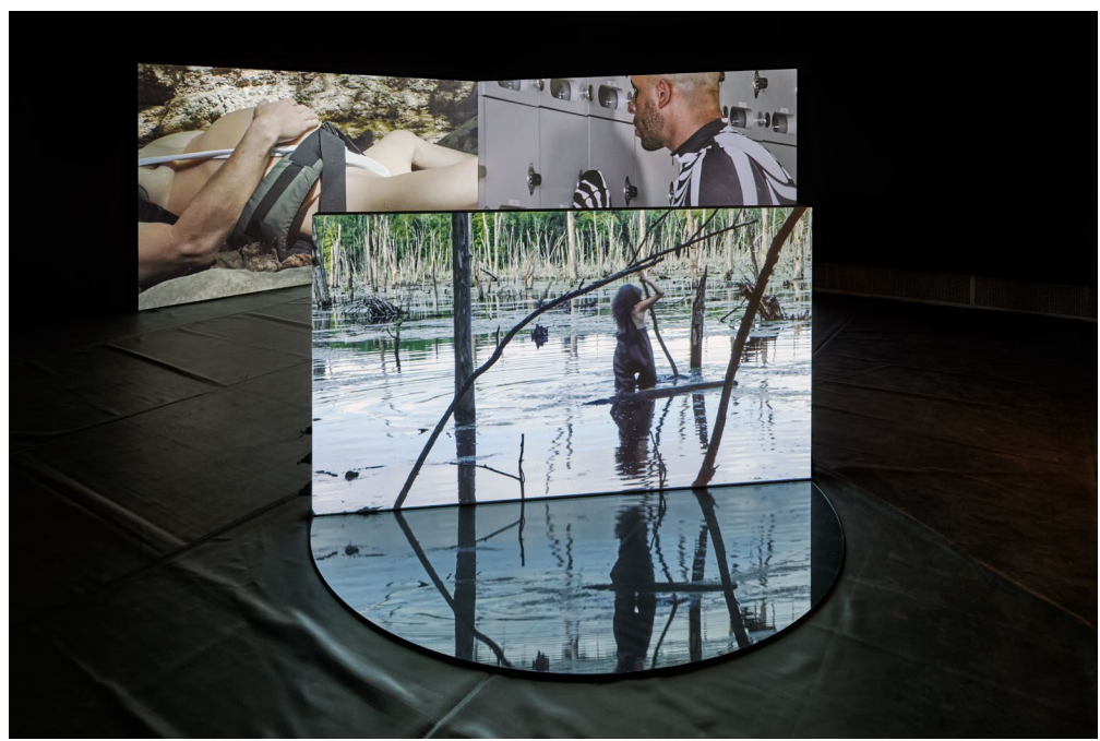
A.K. Burns (U.S., born 1975). What is Perverse is Liquid. 2023. Multi-media 3-channel HD video installation, 35 min. Installation includes: two projection screens, free-standing projection wall, plexiglass, sandbags, sand, rubber pool liner, pennies. Courtesy of the artist. [Installation view of Of space we are... , Wexner Center for the Arts, Columbus, Ohio. 2023.].

A.K. Burns, a New York-based artist, explores feminist and queer perspectives through a diverse range of mediums including video, sculpture, and installations. The Henry exhibition delves into the intersections of landscapes, human bodies, and water across Burns's art, particularly focusing on the Negative Space series (2015-23).