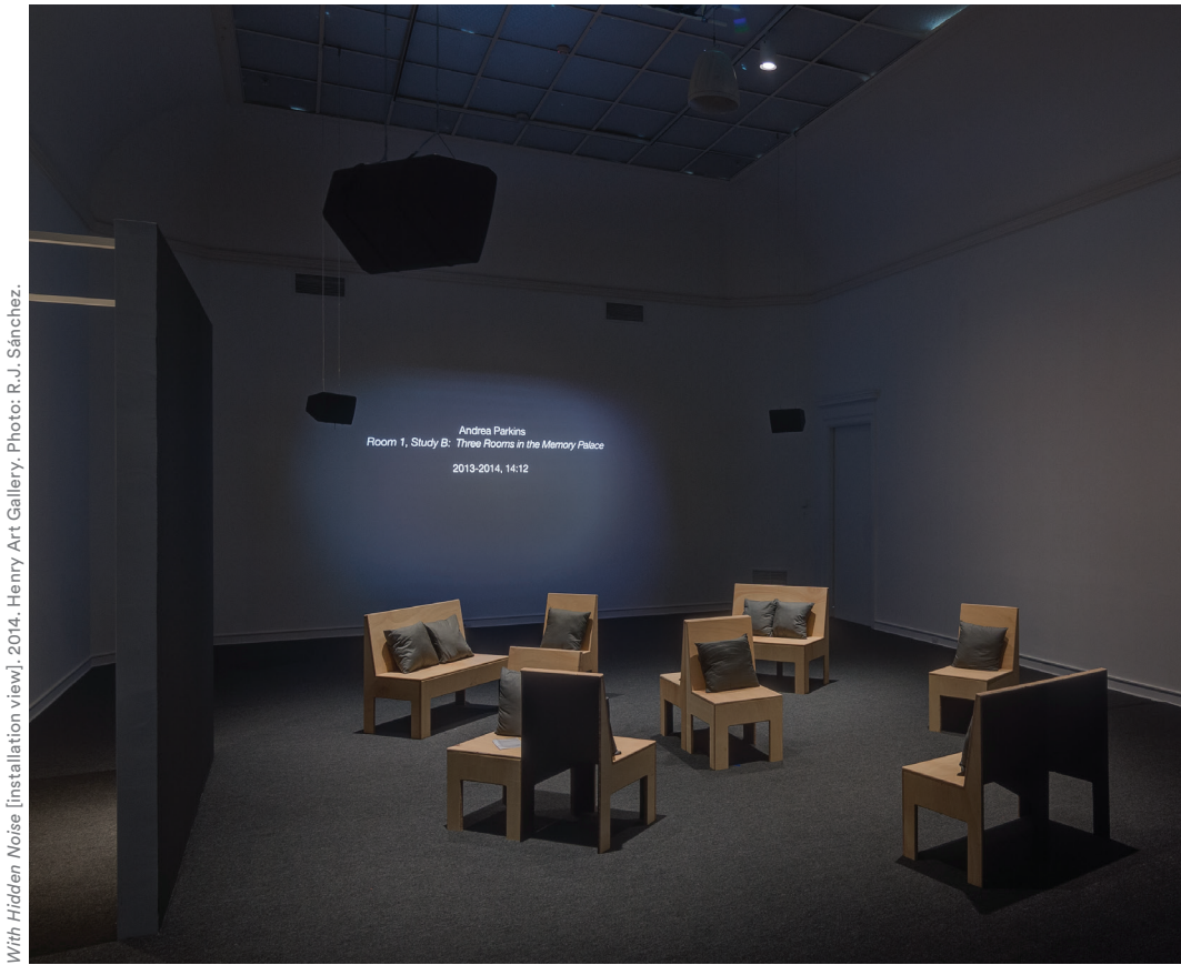
With Hidden Noise [installation view], 2014. Henry Art Gallery.