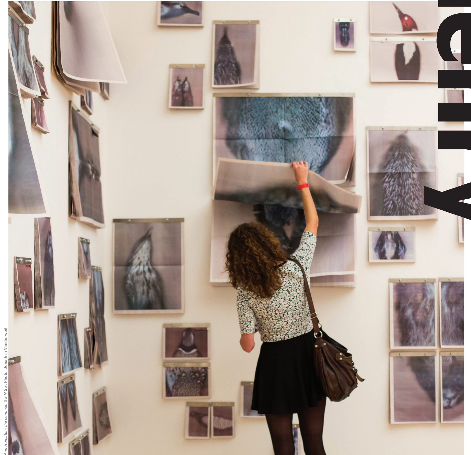
Ann Hamilton: the common S E N S E.