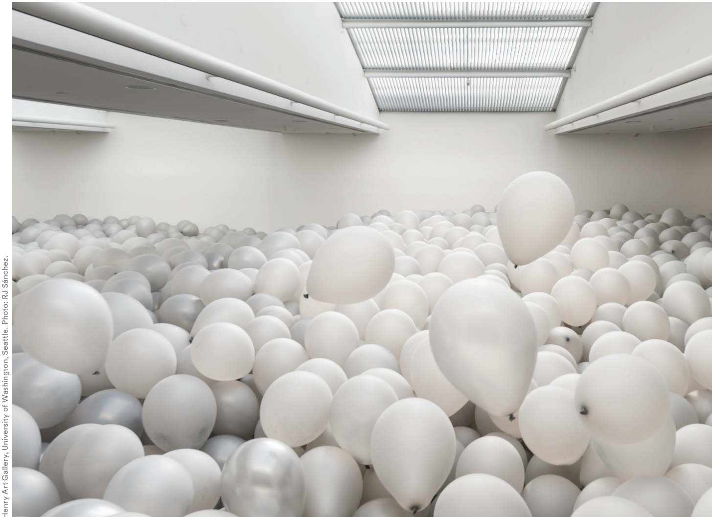
Martin Creed: Work No. 360: Half the air in a given space [installation view], 2015. Henry Art Gallery, University of Washington, Seattle.