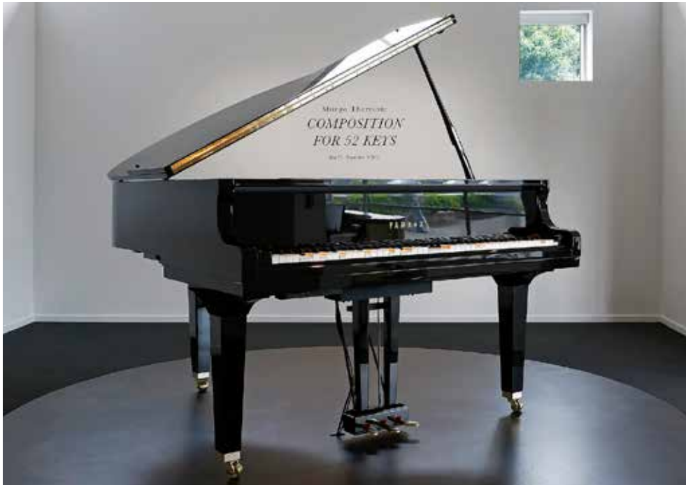
Above: Mungo Thomson: Composition for 52 Keys [installation view]