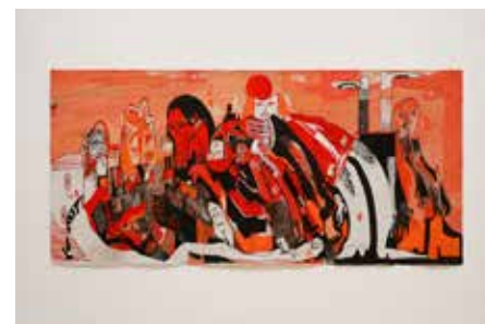
Right: Doris Totten Chase: Changing Forms [installation view]