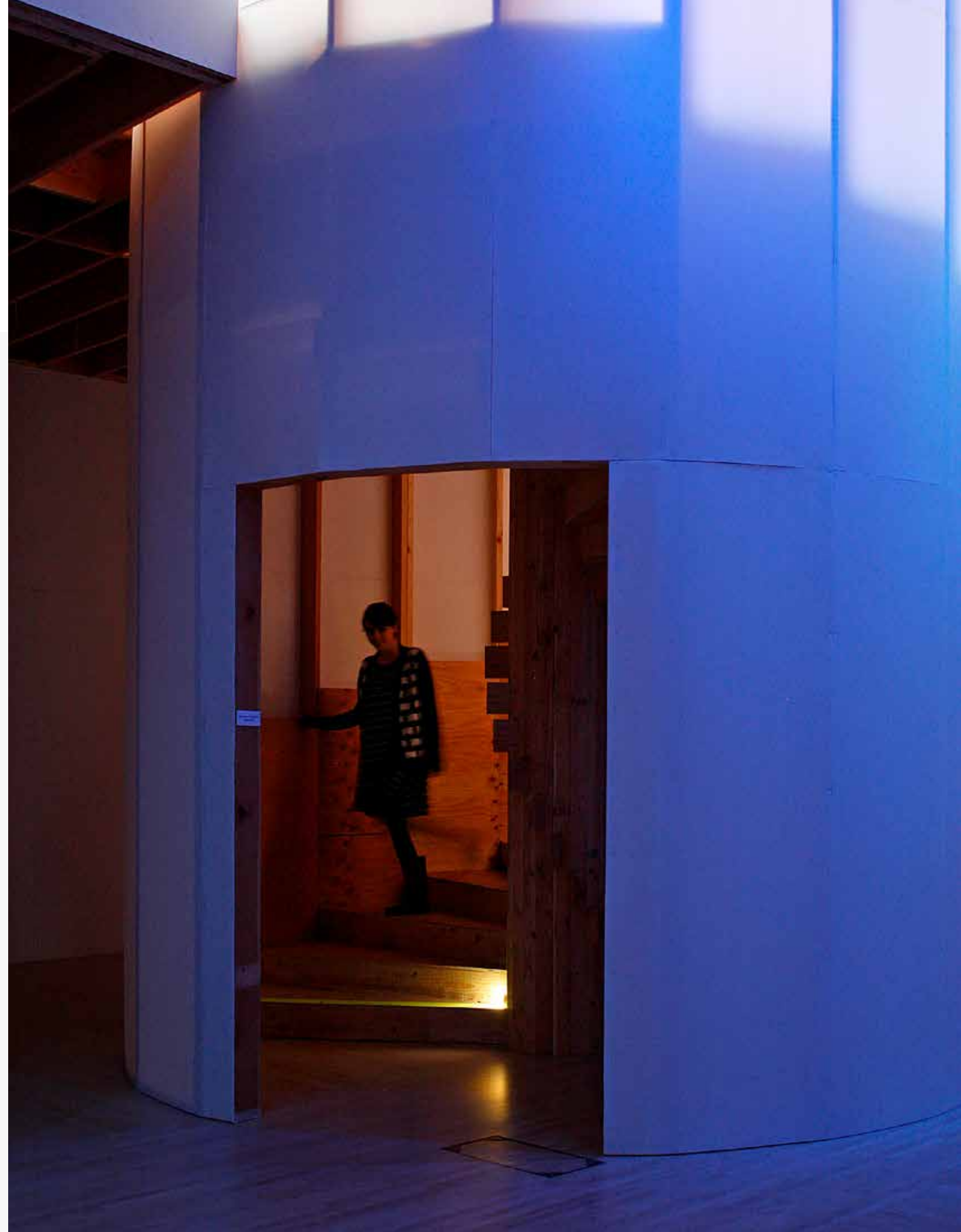
Image: Fun. No Fun. Kraft Duntz featuring Dawn Cerny [installation view]