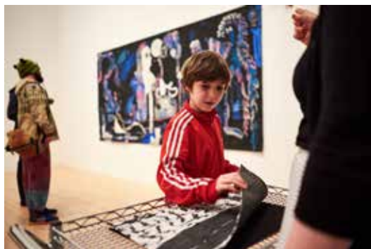
Clockwise from top right: Guests at the 2017 Arty Party.